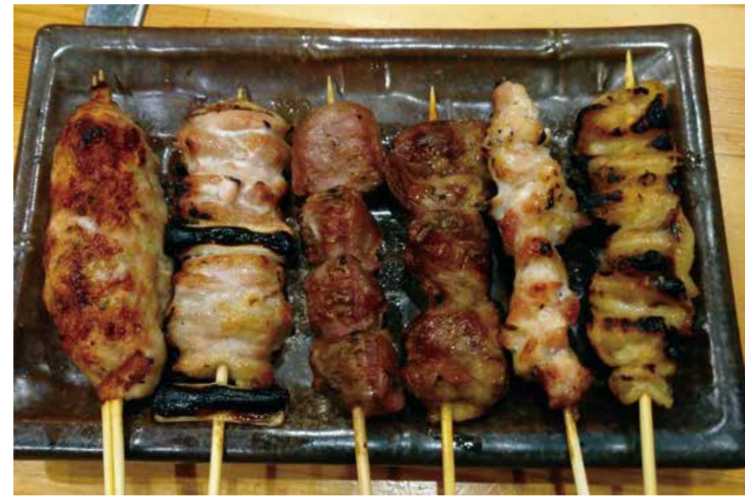
Assortment of 6 pieces