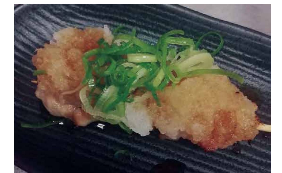
SESERI OROSHI PONZU