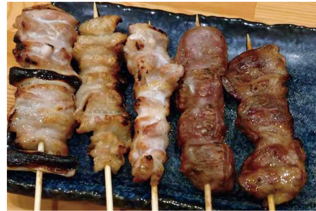
Assortment of 5 pieces